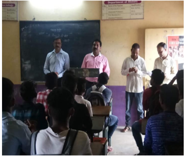
Plays in NSS Adopted Village Jamli